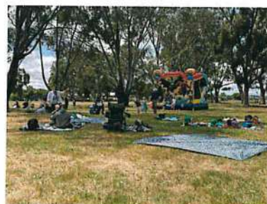
2023 Spring Picnic in the Park